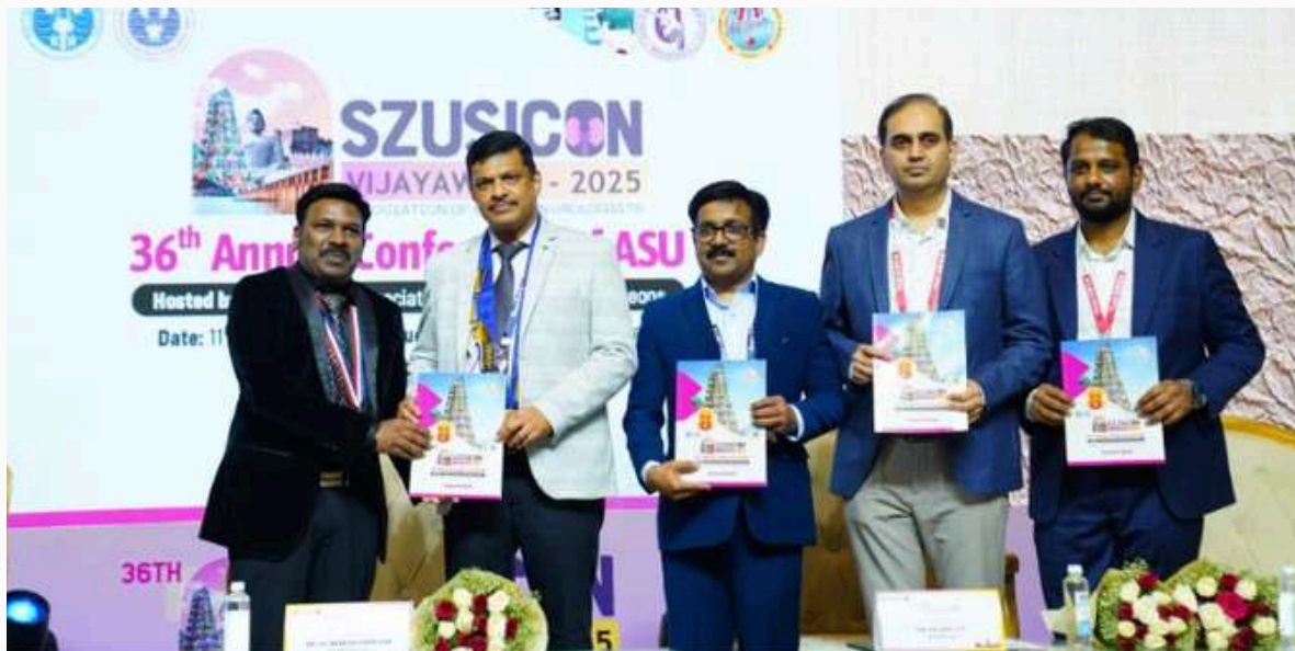
Release of souvenir at SZUSICON 2025 during the Inauguration Session.