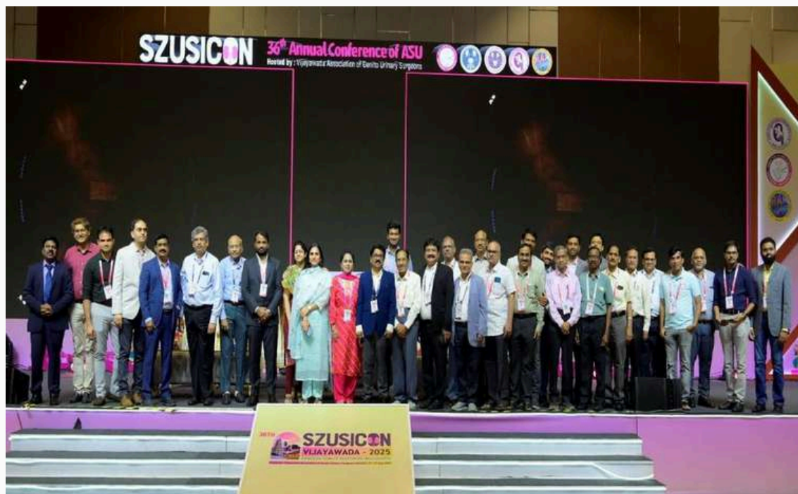
With SZUSICON 2025 Organising Team & with Other Delegates