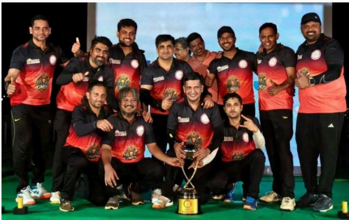
Cricket Winners Team Bengaluru