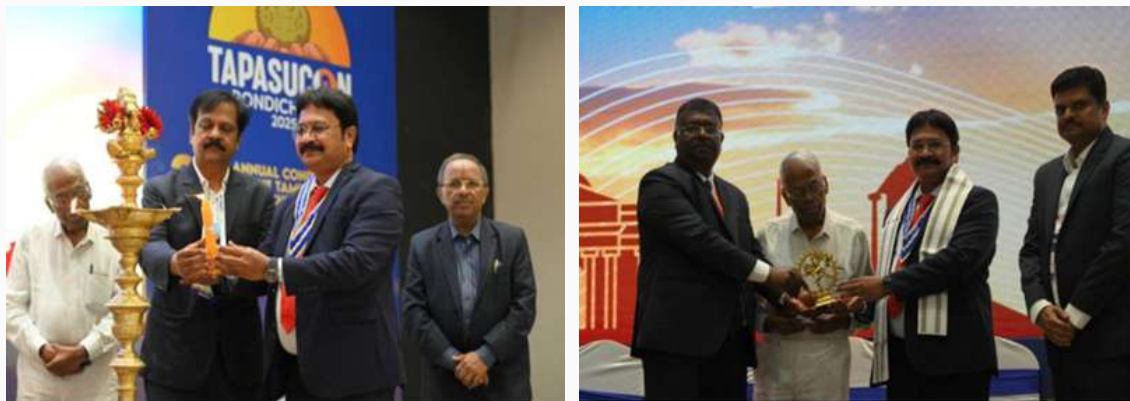
Inaugural Session of TAPASUCON 2025

Unique features included the Tamil Maruthuva Peravai session (conducted fully in Tamil) and the introduction of named halls – Dhanvantari, Sushruta, and Thirumoolar. With excellent ambience, hospitality, and a meticulously curated scientific programme, TAPASUCON 2025 was a resounding success, strengthening academic excellence and professional bonding among urologists of the region.